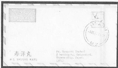
⑰ TIMARU (N.Z.)