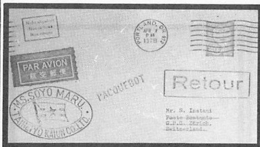
⑭ PORTLAND (U.S.A.)