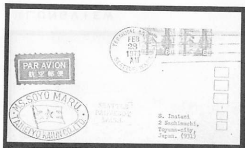
⑬ SEATTLE (TERMINAL ANNEX)