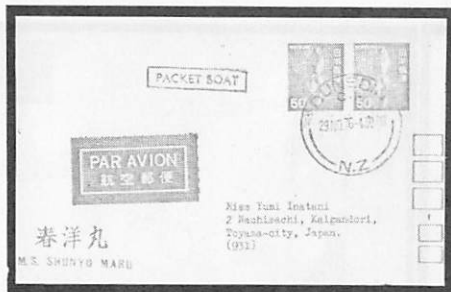
⑯ DUNEDIN (N.Z.)